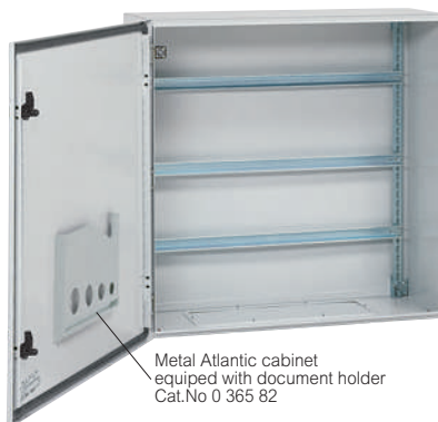
Metal Atlantic cabinet equipped with document holder Cat.No 0 365 82