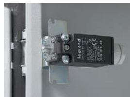
0 363 13