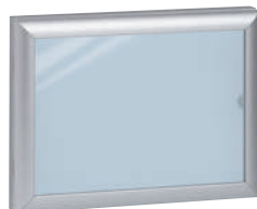
0 475 45